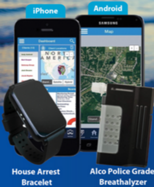
House Arrest Bracelet